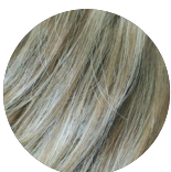
L18/22 WHITE OAK