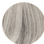
L92 WHITE BURCH G