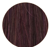
L4/74R PURPLE HEART

We have added 8 new colors to our portfolio, which are already added to our well known styles from the Lotus collection as well as in the new styles. These choice of colors and styles will delight definitely your customers.