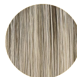
L8/22R ASPEN MELANGE ROOTED