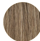
LR12/14LR BIRCH ROOTED G