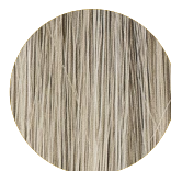
L6/22 AR ASH ROOTED